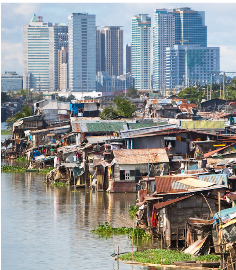
Contrasts in Manila, the Philippines